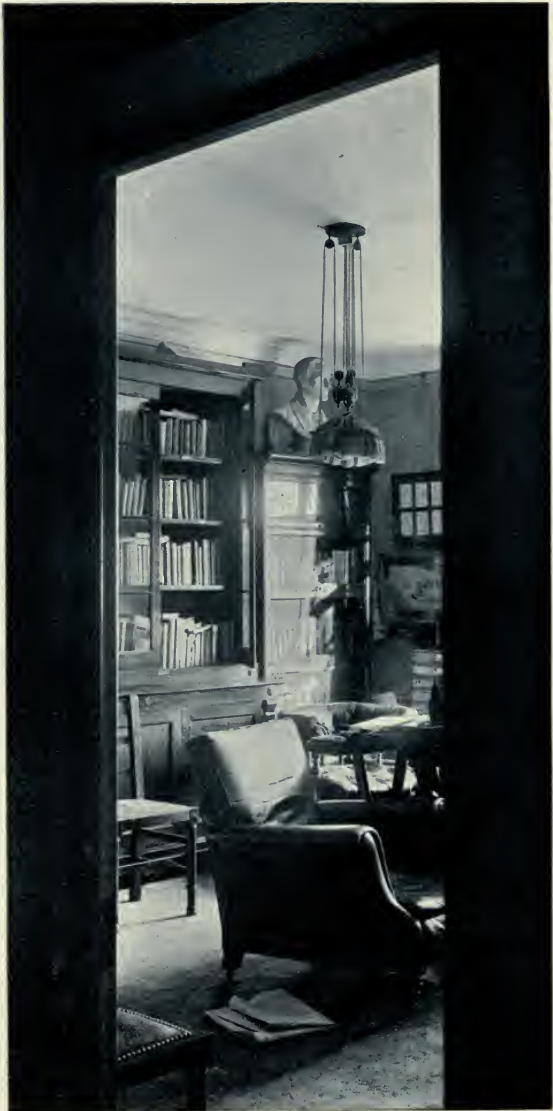
THE AUTHOR'S STUDY.